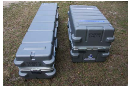
PLP-38 MOB packed in transport cases