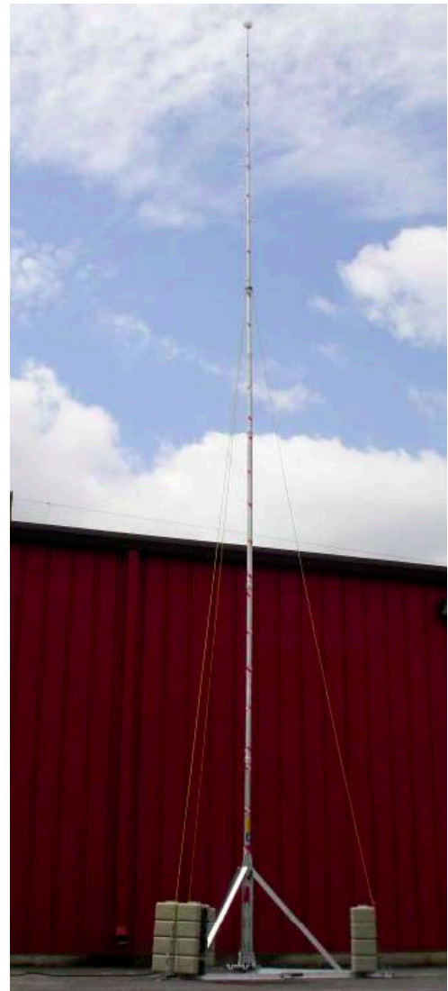
Fully deployed PLP-38 MOB

The StrikeMaster®PLP-38-MOB is proprietary to LBA Technology and key technology is patent protected. It is fully compliant to National Fire Protection Association (NFPA) standards.