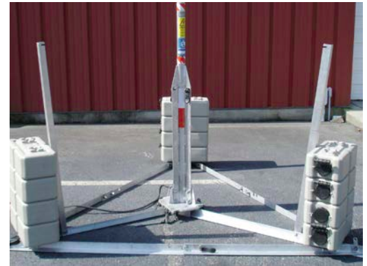
PLP-38 MOB base ready for move or disassembly

The StrikeMaster® PLP-38-MOB is designed for minimum maintenance. Normal requirements are only routine inspection of base components and tightening of ground system attachment hardware if needed. Standard customer practices should be employed to protect the deployed system from unauthorized personnel or vehicular contact. For maintenance support, a replaceable spares kit is available.