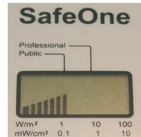
▲ Example with 2.66 Volts (7 bars)

When the voltage reaches 2.4 Volts (3 bars) approximately 10% capacity is left. When 2.32 Volts is reached the SafeOne® will start to give short warning beeps every 38 seconds. To ensure continued operation the batteries need to be replaced.